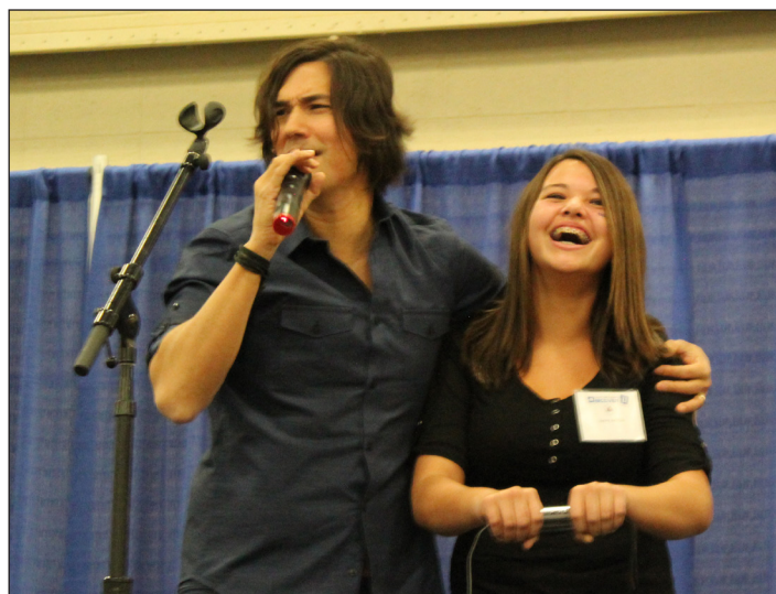
David Usher served as a keynote speaker at the Student Leadership Conference. Here he performs with a student from Picture Butte High School.

This will be the first of Palliser's Calgary schools that is started by the division. The other programs were former private schools who joined the school division as alternative programs.